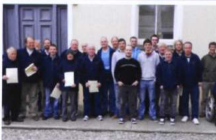
Plaque presented to GMIT Letterfrack and staff, students and clients of QDS and GMIT