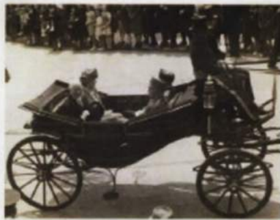
The image above shows Sean T. O'Kelly at his inauguration as Second President of Ireland in 1945 in the Landau.

Visitors to Conservation Letterfrack last year for Heritage Day, were delighted to be able to view the State Carriage (Landau) which underwent conservation treatment in our workshop in Letterfrack last year.