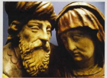
A close up of the Figure sculpture of Joachim and Anne in polychrome wood.

and antiquities formed by John and Gertrude Hunt during their lifetimes. The Customs House is regarded as the most distinguished 18th century building in Limerick, it is an elegant Palladian-style building designed by the Italian architect, Davis Ducart, in 1765 was extensively restored and refurbished by the OPW in 1996 and so realised the dream of John and Gertrude Hunt to have their collection housed in Limerick. The Customs House opened as The Hunt Museum on 14 February, 1997.