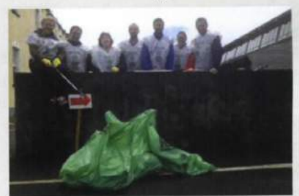
A cross section of GMIT Staff, Connemara West Staff and Aquinas College during the Green Campus Village clean up in April.