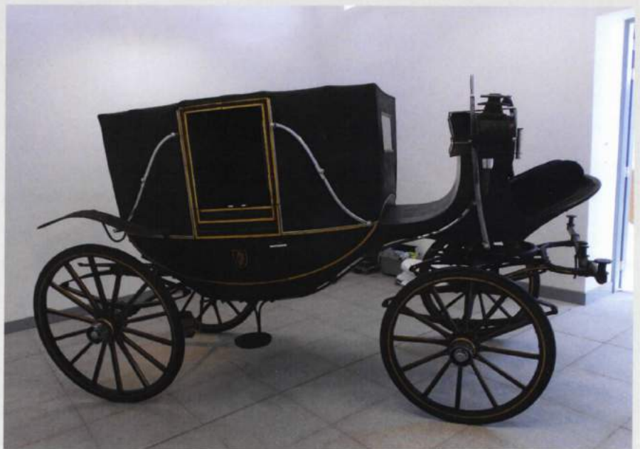
The State Carriage after conservation in the newly converted stables in Aras an Uachtaráin.