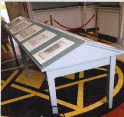
Display table made by Conservation Letterfrack for Casino Marino.

The 18th century Casino, at Marino, is Dublin's famous neo classical villa outside Fairview. It was designed by the Scottish architect William Chambers, the project was supervised by the sculptor/mason Simon Vierpyl for James Caulfield, fourth viscount and first earl of Charlemont (1728 -1799). Conservation Letterfrack worked with the OPW to create a mounting system and display tables for the exhibition, 'Paradise Lost: Lord Charlemont's Garden at Marino', Conservation Letterfrack have also worked with the OPW on providing solutions for hanging exhibitions in Dublin Castle and the Main Guard in Clonmel.